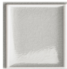
Gray 5" x 5" x 5/16" IFS5X5MG