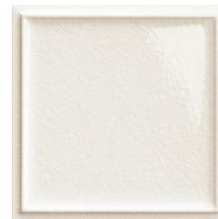
White 5" x 5" x 5/16" IFS5X5MW