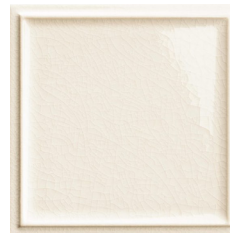
Cream 5" x 5" x 5/16" IFS5X5MCR