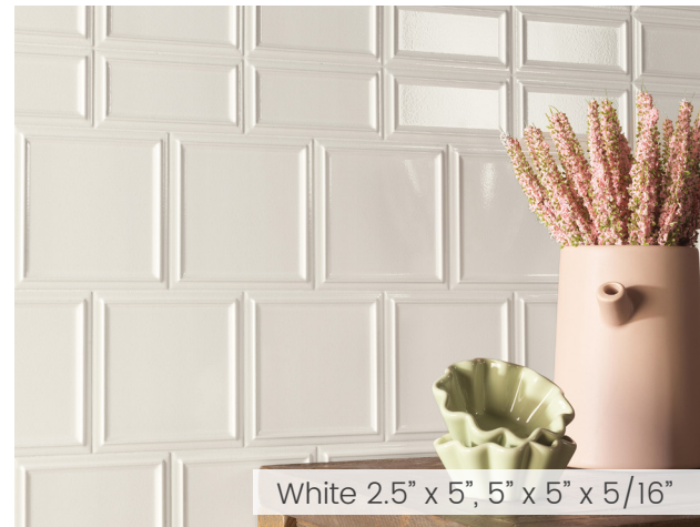
White 2.5" x 5", 5" x 5" x 5/16"

View all of our product options and detailed specifications at: mlwsurfaces.com